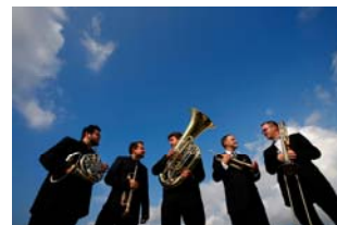
Boston Brass, 4/17/2011