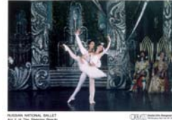
Sleeping Beauty, 1/22/2011