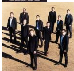
The Ten Tenors, 12/17/2010