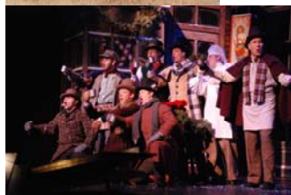
A Christmas Carol, 12/19/2010