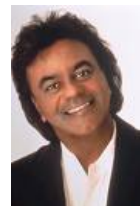
Johnny Matthis, 4/3/2011