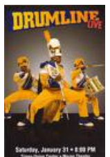
Drumline Live, 11/18/2010