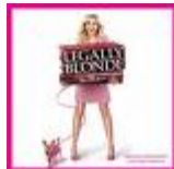
Legally Blonde, 10/10/2010