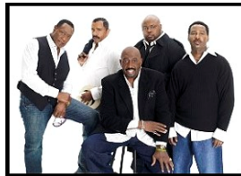
Four Tops and Temptations, 9/30/2010