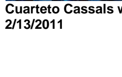
Cuarteto Cassals with Andreas Klein, 2/13/2011